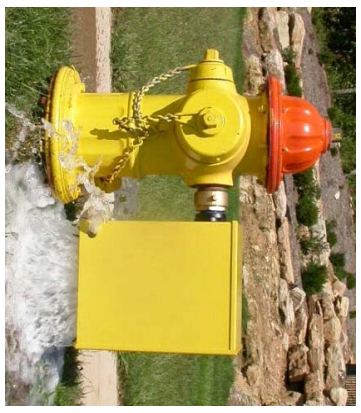
ECLIPSE #9700 Portable

Contact Us Toll Free: 1-800-231-3990 Fax: 314-231-2820 info@hydrants.com www.hydrants.com