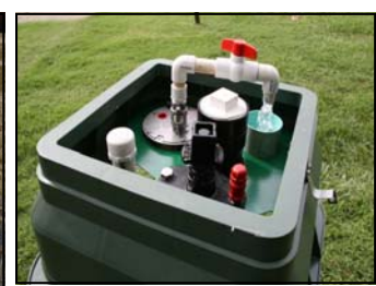
Eclipse #9900 Permanent-Water Quality Station ("All-in-One")