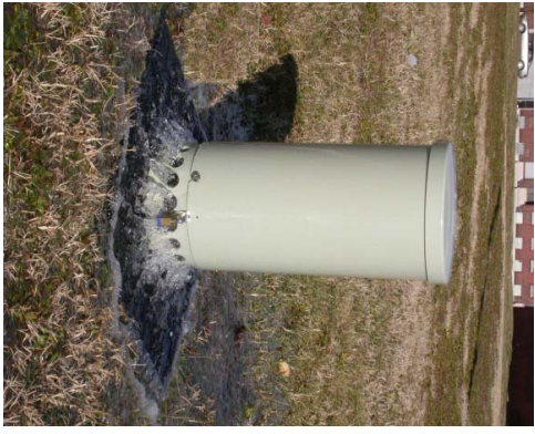
ECLIPSE #9400 Stationary Surface Discharge