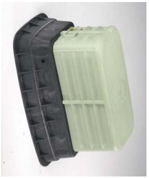
ECLIPSE #9800 Stationary Direct Discharge