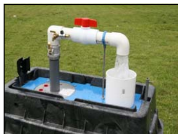
Eclipse #9800 Permanent-Direct Discharge