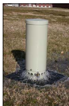
Eclipse #9400 Permanent-Surface Discharge