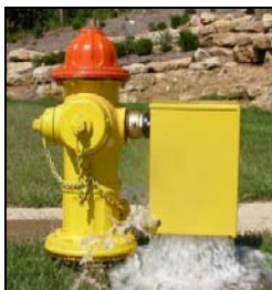
Eclipse #9700 Portable

In 2010, the EPA categorically approved portable and permanent automatic flushing devices (Attachment 2—2010 Clean Water and Drinking Water State Revolving Fund, Part B-DWSRF 2.2-11) for GPR funding. This means Public Water Systems (PWS) can apply for funding in the forms of grants or low-interest/long-term loans to install automatic flushing devices, like the models Kupferle manufactures below, in order to save water, time and money! (see cost benefit calculator on back cover)